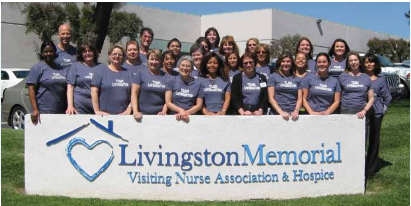
TEAM LIVINGSTON: through June, Livingston staff have contributed $8,626 to the agency's annual fund goal of $692,000. Over 30 percent of Livingston employees have made donations, with a goal of 50% participation by year's end.